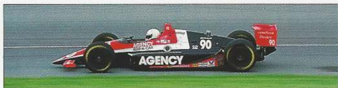
The second woman ever to compete in the Indy 500, Lyn St. James was named their Rookie Of The Year in 1992.

been on the fast track. With "Rookie Of The Year" honors at the Indy 500, numerous international closed-course speed records, and two victories at Daytona's legendary endurance race, "taking it easy" is not a phrase she